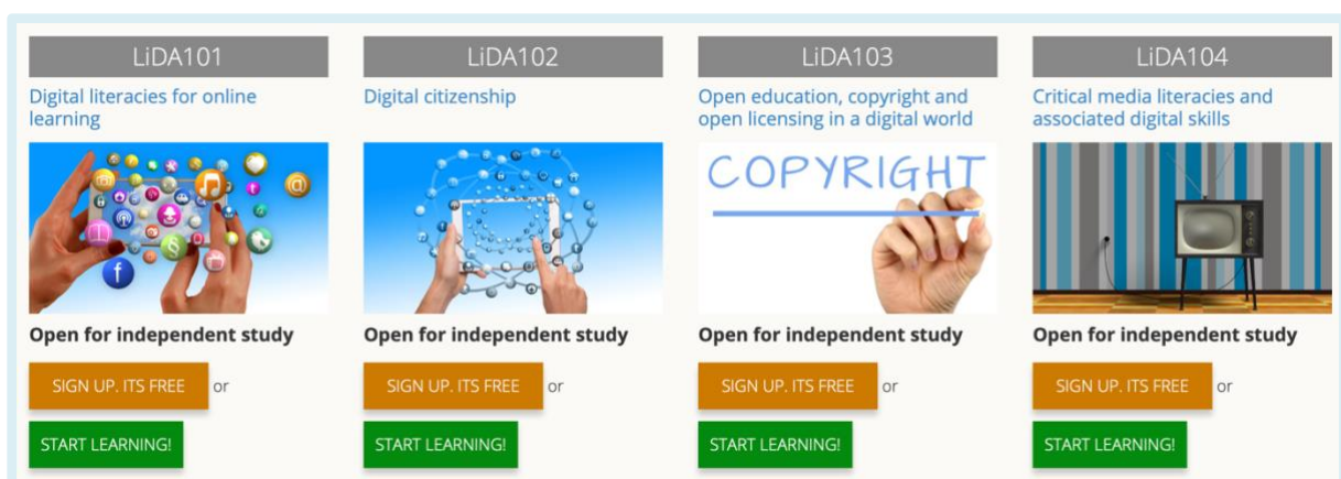
Figure 1 LiDA micro-courses on the OERu website

Since July, 2019, LiDA has been offered as a self-directed elective course in three of Otago Polytechnic's (New Zealand) undergraduate programmes. Learners can access course materials directly from the open OERu WordPress site, while a more discipline-specific assessment process has been introduced for one of the programmes via the Polytechnic's Learning Management System. 6 Learners may choose to interact with the open OERu tools or work within the forums in Otago Polytechnic's Moodle instance. During 2021, the course was submitted to the New Zealand Qualifications Authority, which has evaluated the LiDA micro-credential delivered by OERu and assessed it to be equivalent to 16 credits (160 notional learning hours) at Level 5 on the New Zealand Qualifications Framework. 7 This quality endorsement adds significant value to the LiDA micro-credential which supports both learners and employers.