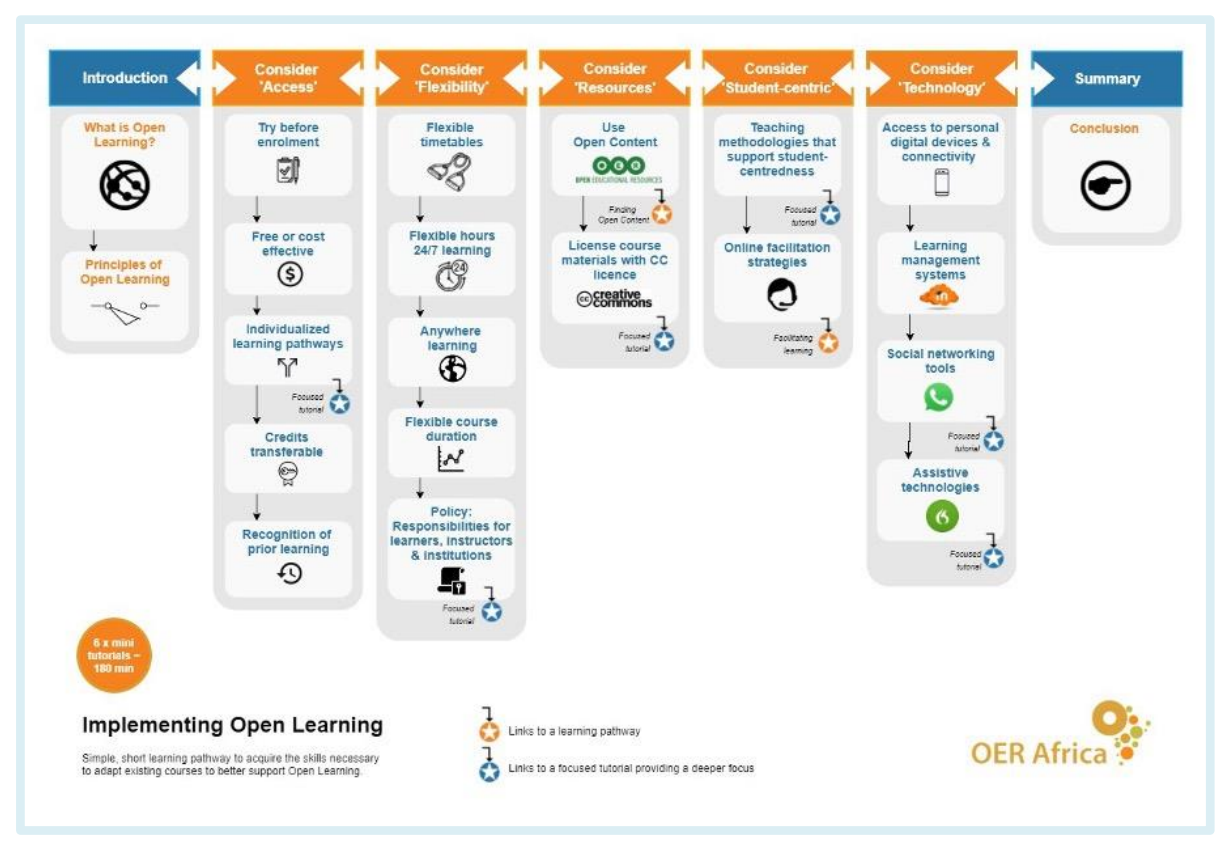
Figure 1 Learning Pathway on 'Implementing Open Learning'

Taken together, these learning pathways aim to develop effective OER practices. The learning pathways can be completed quickly without travel costs, and without requiring time away from the classroom. The benefits are clear, practical, and can be immediately applied to improve the professional work of academics.